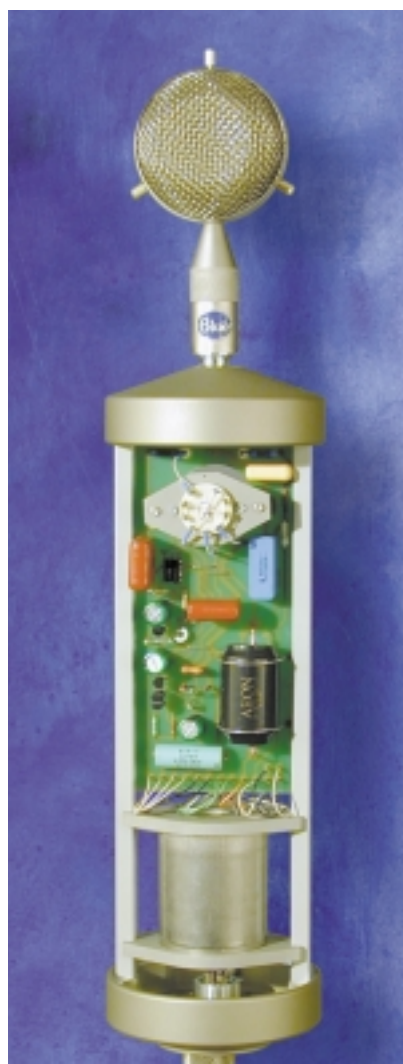
Inside the Bottle

SAFETY NOTE: Do not attach a capsule or the multi-pin Champagne cable to The Bottle until it has first been attached to a stand. Once the microphone body is secure, connect the Champagne cable to The Bottle and the 9610 power supply, and then turn on the 9610 to start the warm-up process. At the end of a session, be sure to turn off the 9610 power supply before disconnecting the Champagne cable.