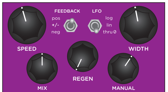
Keep Yourself Alive