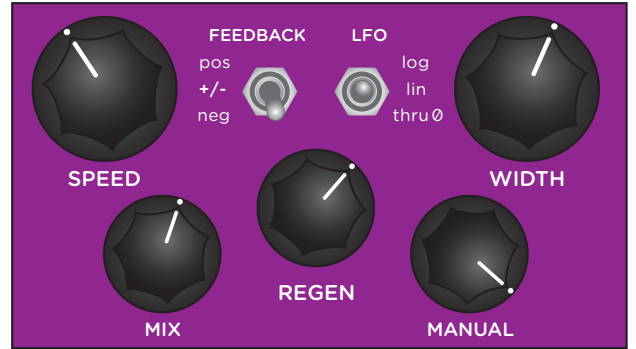
70's Vintage Flanger